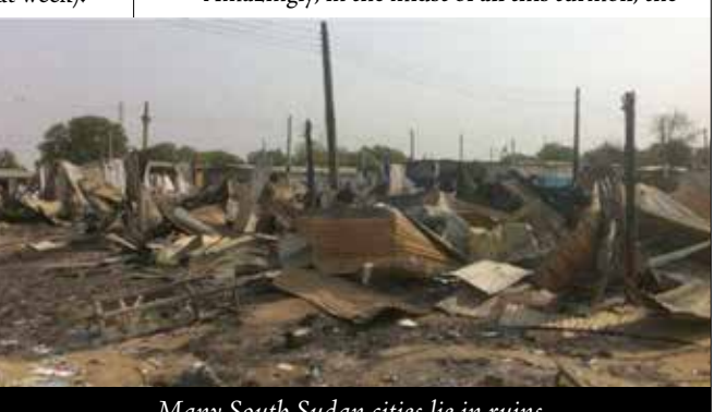
Many South Sudan cities lie in ruins.

Amazingly, in the midst of all this turmoil, the