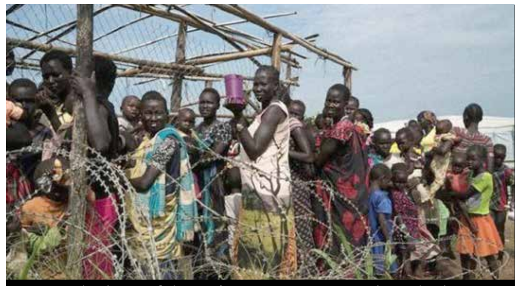
South Sudanese are flocking to refugee camps in countries surrounding South Sudan.

of the population regularly fleeing to either the bush or to refugee camps for months at a time.