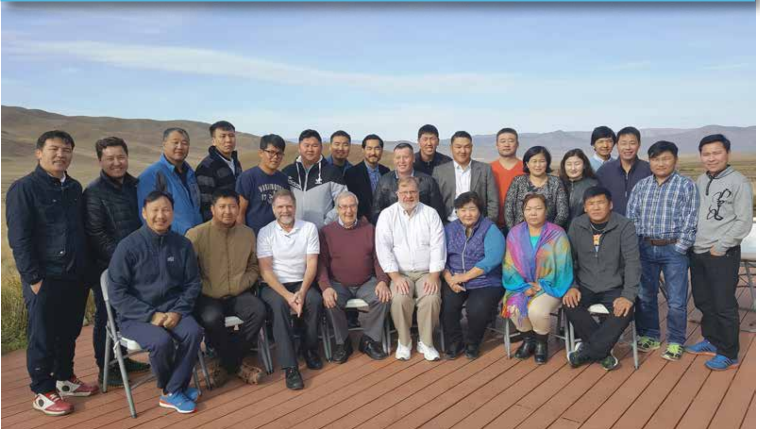
Mongolian Church Leaders

“Go ye into all the world, and preach the gospel to every creature” (Mark 16:15).